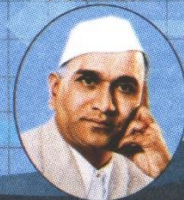
Karmaveer Bhausaheb Hiray